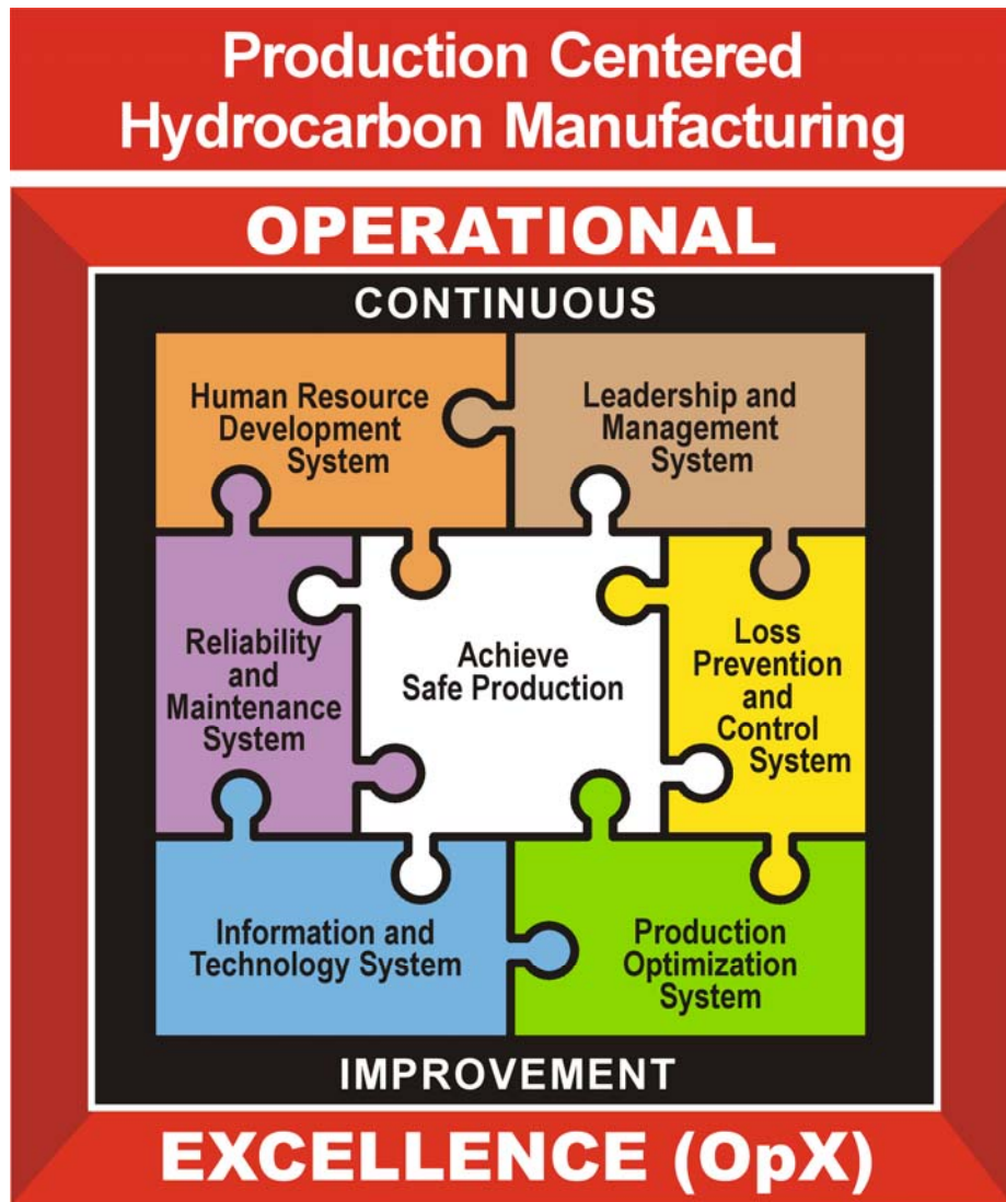
Figure 1-1. OPERATIONAL EXCELLENCE (OpX) MODEL

“Operational Excellence (OpX) is a term that is used to describe a corporation’s and/or plant’s approach and standards of manufacturing. Operational Excellence (OpX) provides the plant with defined support systems and processes involved in operating a plant to produce product(s). Operational Excellence (OpX) consists of support systems and processes based on best practices. The best practices must reflect the most highly regarded practices applicable to a specific industry and a plant’s current situation and needs”. They are shown in Figure 1-1. 1